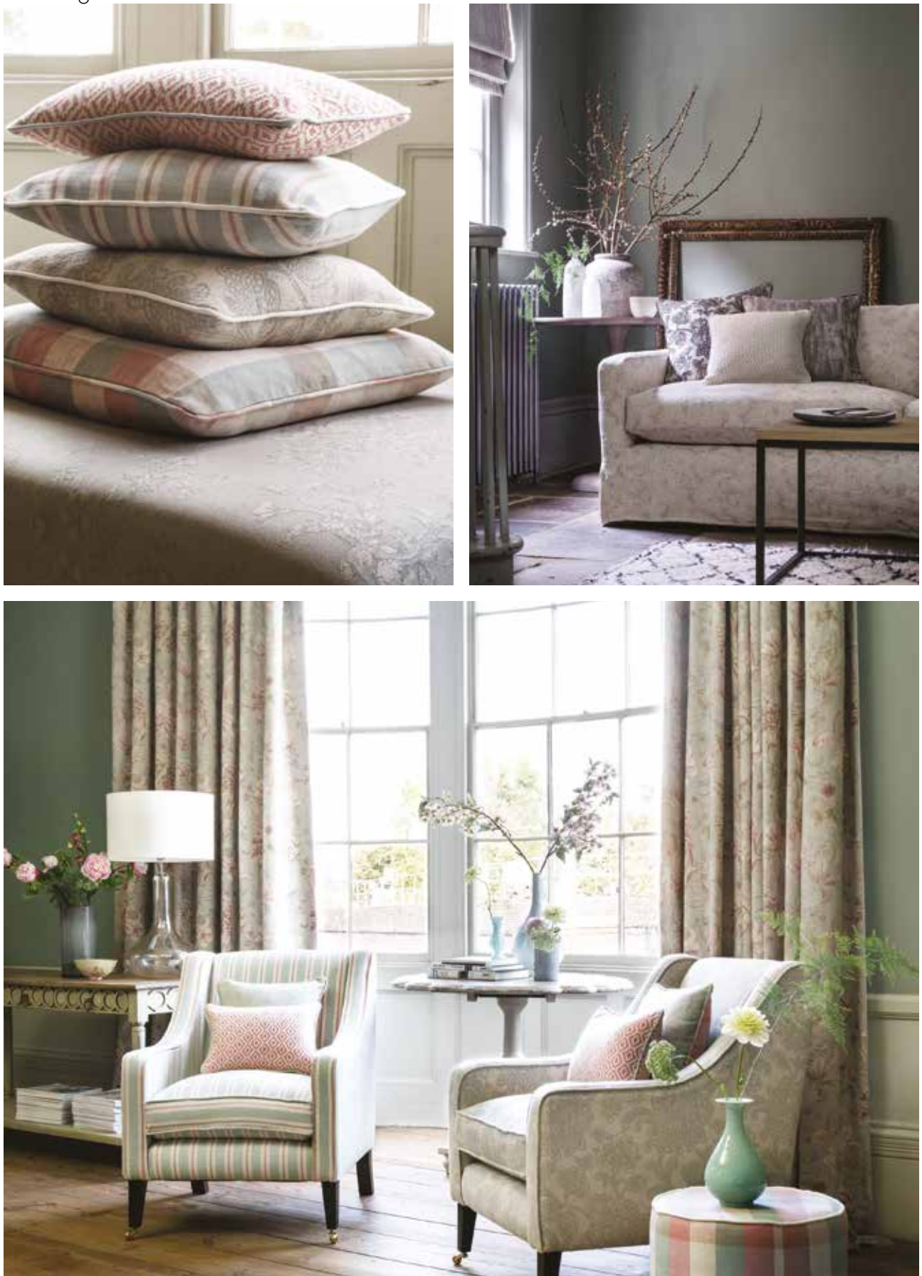
(Top left) Cushions top to bottom: Keaton Blush, Sackville Stripe Mineral/Blush, Cranbrook Mineral & Austin Check Mineral/Blush Footstool: Simone Mineral (Top right) Sofa: Cranbrook Linen Cushions left to right: Cranbrook Charcoal, Keaton & Baker Silver (Bottom) Drapes: Sissinghurst Mineral/Blush.

Capturing relaxed English country style with elements of shabby chic, six woven jacquards offset a beautiful vintage floral trail print and a plain textured chenille. The perfect choice for modern country décor schemes, these versatile fabrics are suitable for drapes and upholstery. Distinguished and liveable, the mix of scales and styles makes this collection eclectic and charming.