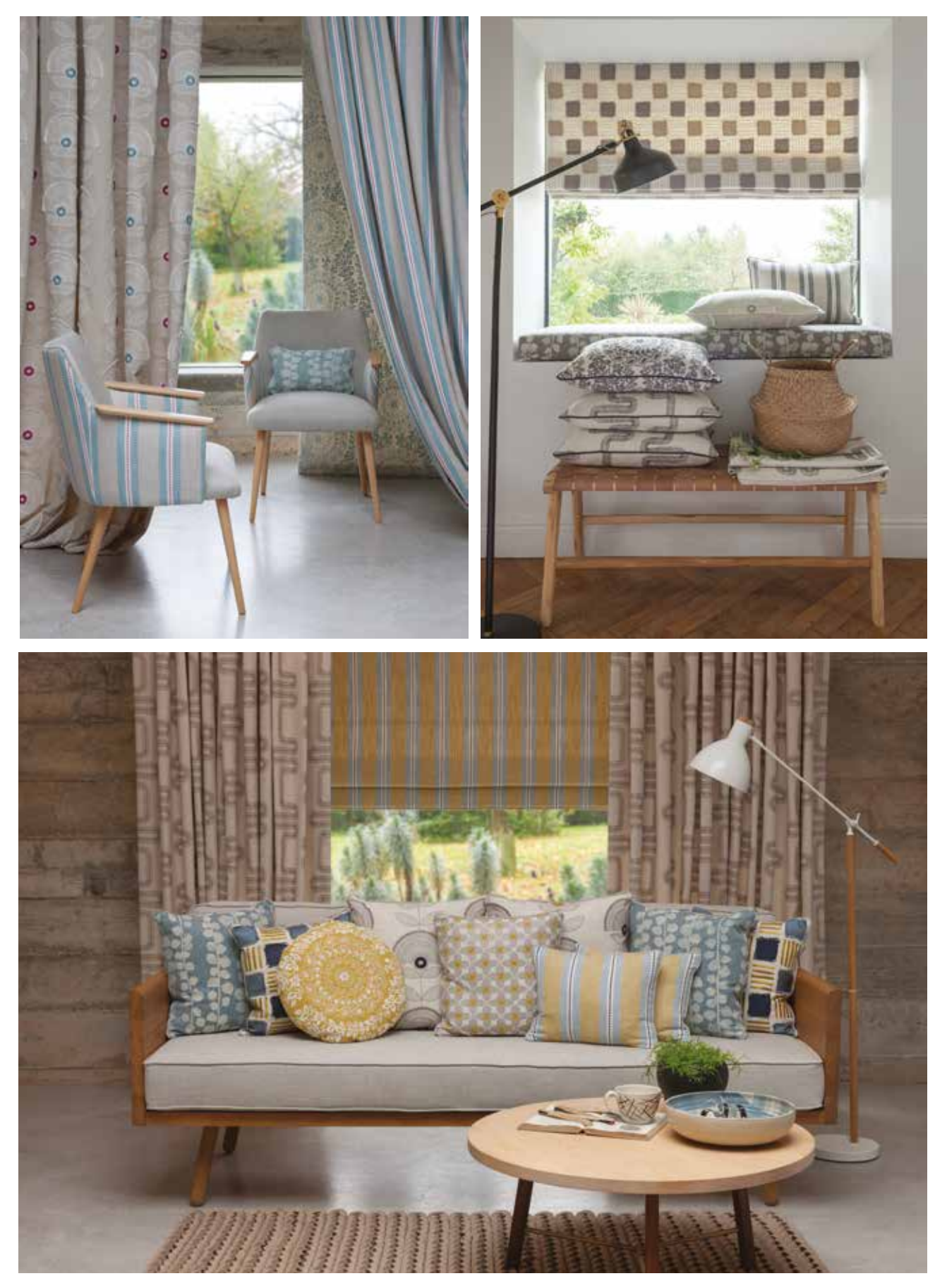
(Top left) Drapes left to right: Calista, Timo Raspberry/Mineral & Sadie Mineral Cushion: Myla Mineral (Top right) Blind: Vita Charcoal (Bottom) Drapes: Mikkel Citron Blind: Timo Denim/Citron Cushions left to right: Myla Denim, Vita Denim/Citron, Sadie Citron, Calista Denim/Citron & Laverne Citron.

Folkloric emblems, chunky stitch effects and clipped yarn techniques create a distinctive Scandinavian look. Linen embroideries in a mid-century style are complemented by woven stripes and leaf trails in this fresh collection, which is rich with texture. Intriguing frayed yarn effects and striking monochromatic detail create interest and eye-catching impact.