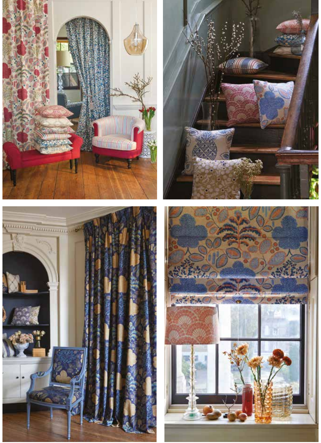
(Top left) Drape: Berwick Trail Denim (Bottom Left) Chair: Bloomsbury Antique/Midnight (Bottom right) Blind: Bloomsbury Denim/Spice Lampshade: Fitzroy Spice.

Bloomsbury Collection Natural motifs flow through this beautiful collection, which draws inspiration from the Arts & Crafts movement. Elegant botanical designs complement printed fabrics that feature exotic elements and intricate trellis patterns. Berry, teal, denim, citron and spice colourways are distinctive and desirable, whilst a herringbone weave and multi-coloured stripe give Bloomsbury a modern edge.