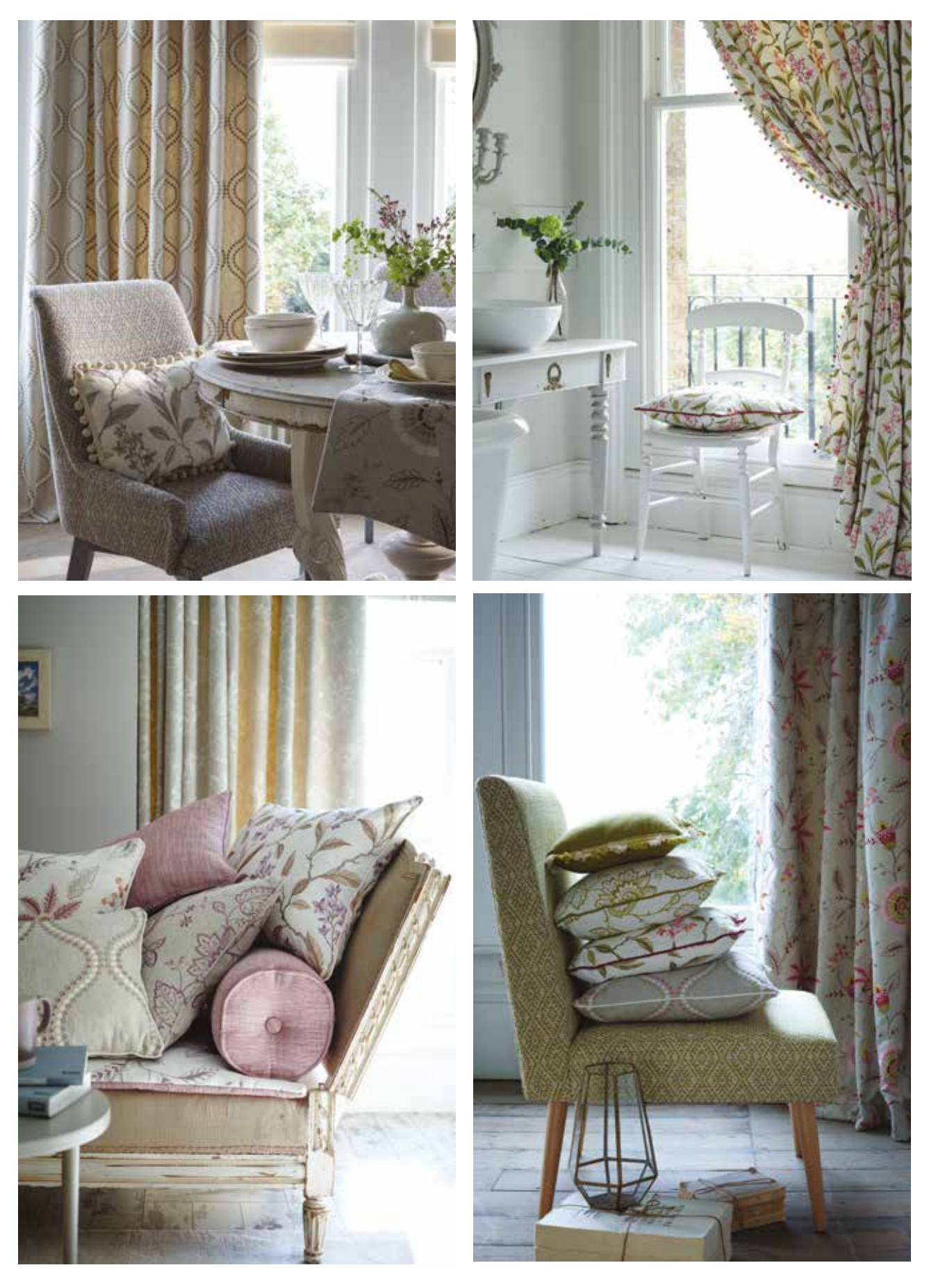
(Top left) Drape: Layton Dove Chair: Hampstead Storm Cushion: Melrose Natural Table Runner: Delamere Natural (Bottom right) Chair: Hampstead Apple

Pretty cottage garden florals embroidered onto linen are the centrepiece of this collection. A soft-flowing, monochromatic paisley design and a delicate diamond pattern on woven jacquards bring contemporary appeal to this elegant collection. Blossom colours mingle with calming neutrals and on trend shades to create a look that works for all seasons.